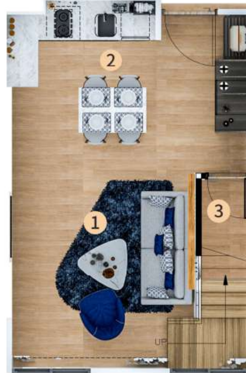
1st floor plan