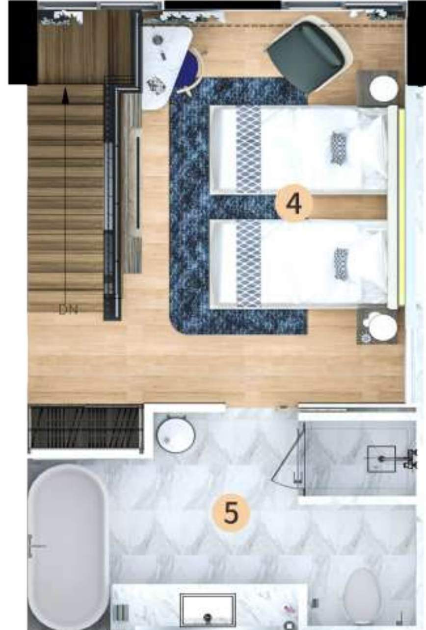
2nd floor plan