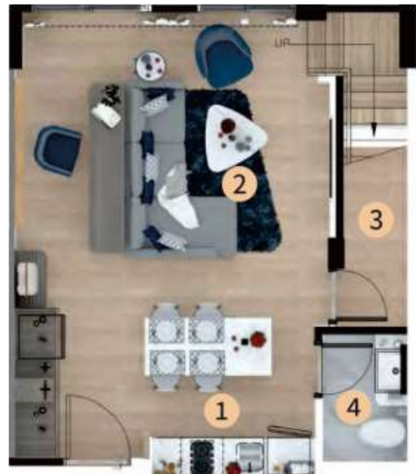
1st floor plan