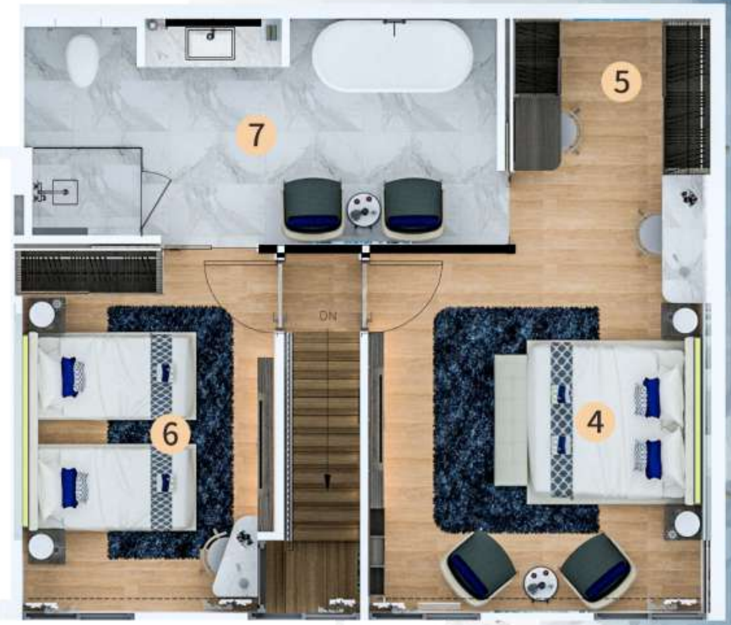
2nd floor plan