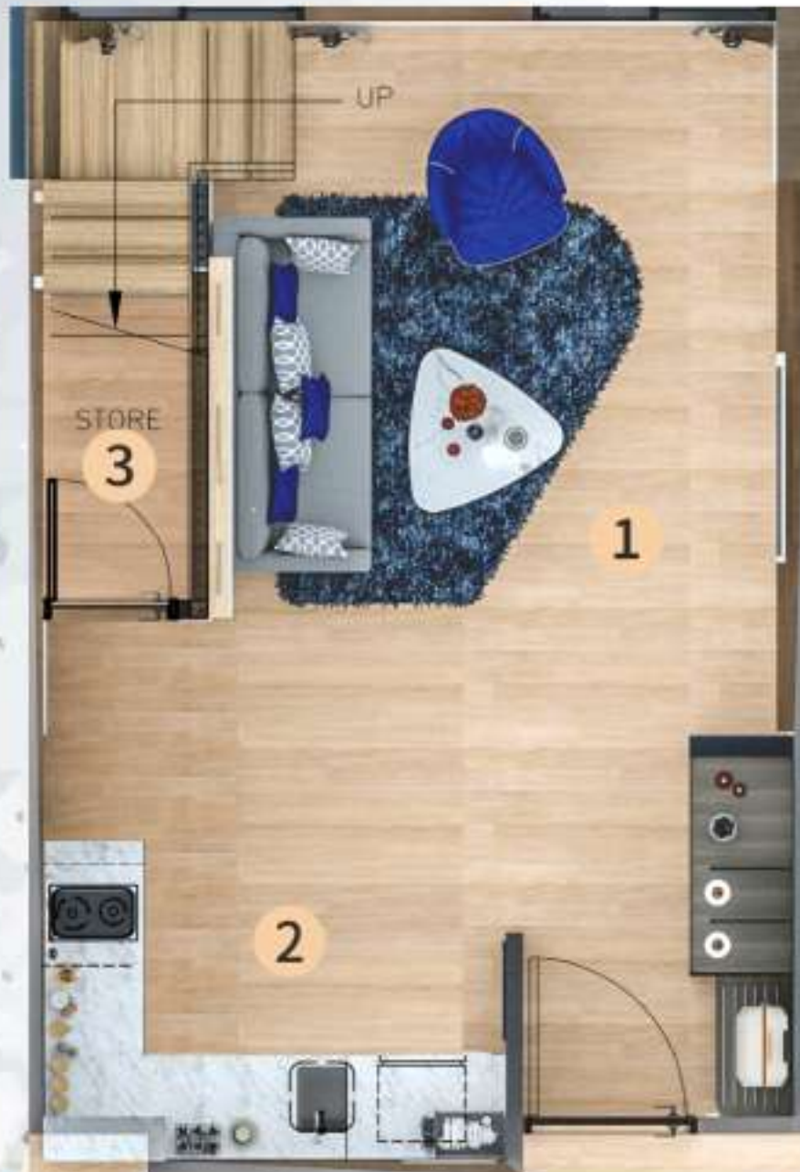
1st floor plan