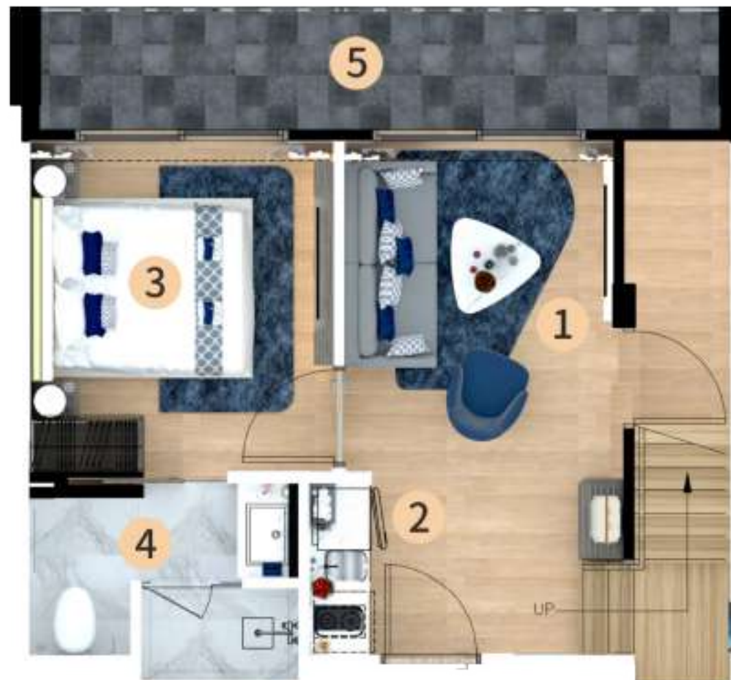
1st floor plan