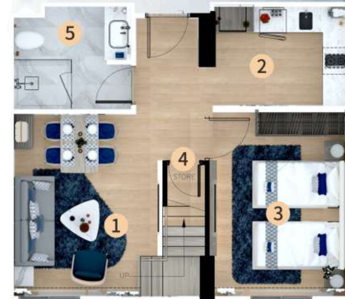
2nd floor plan