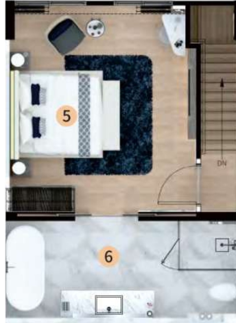
2nd floor plan