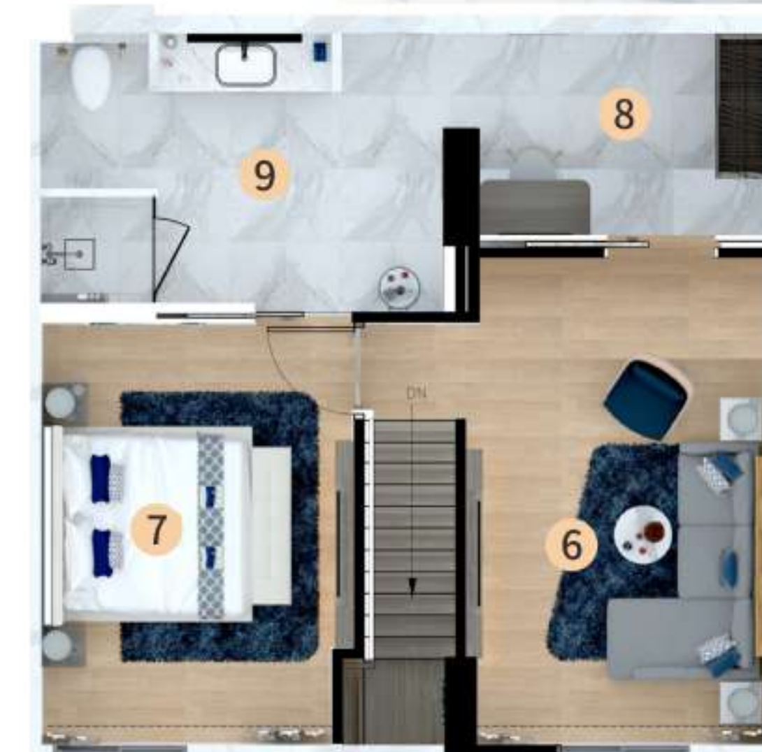
1st floor plan