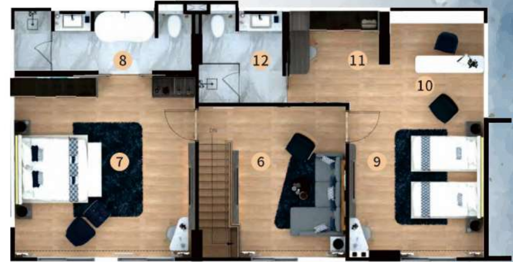
2nd floor plan