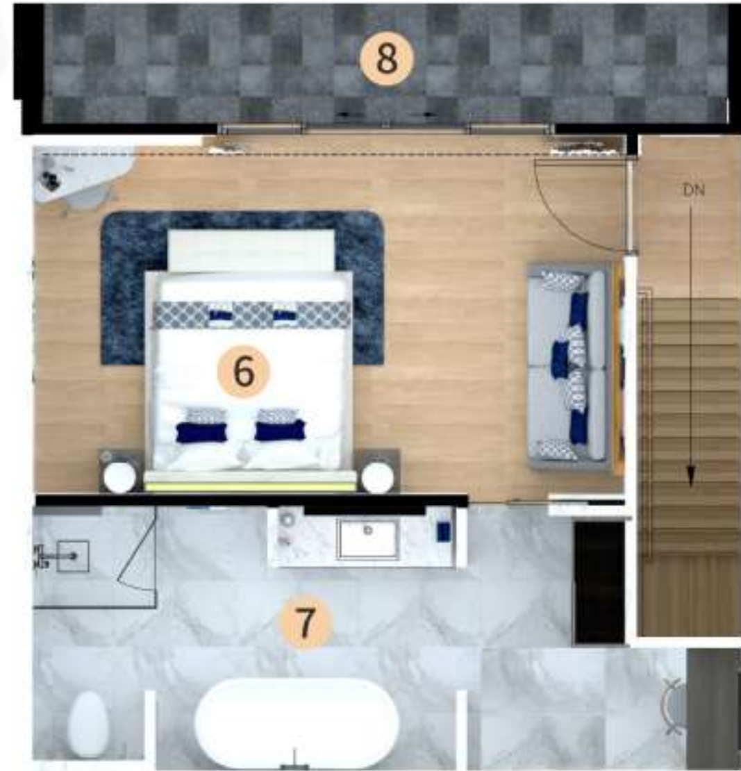
2nd floor plan