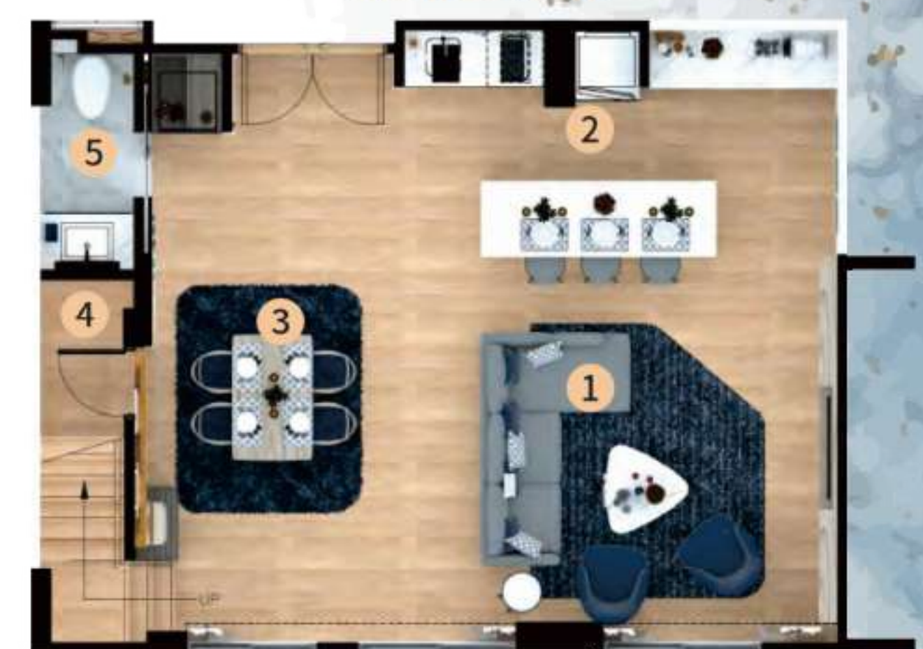
1st floor plan